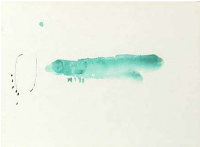
Untitled - Emerald Form c.1960 Watercolour, 17 x 24.7 cm