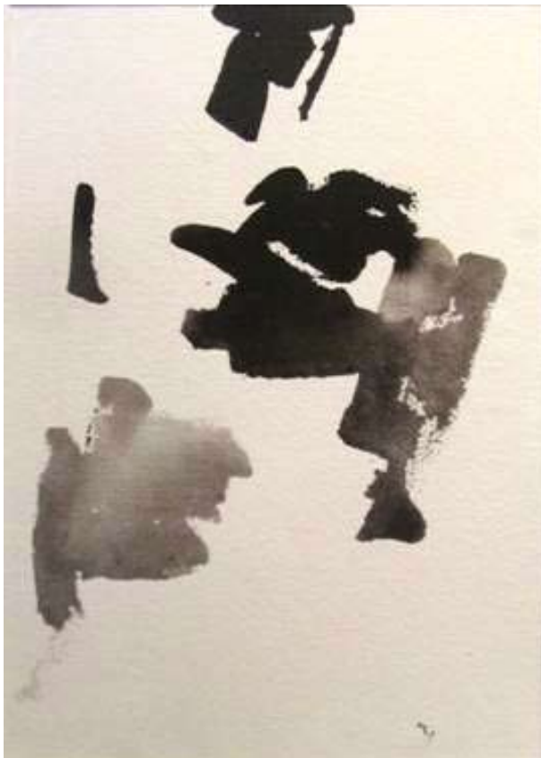
Untitled, c 1968