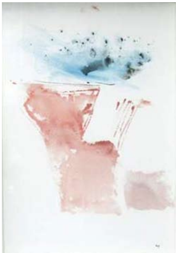
Landscape, c.1970 Watercolour, 25 x 18 cm Signed with initials