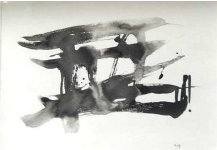
Untitled, c.1946 brush and black ink, 18 x 25 cms