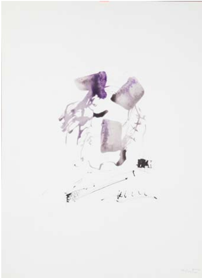
Untitled, Arrangement in Purple and Grey, c.1975