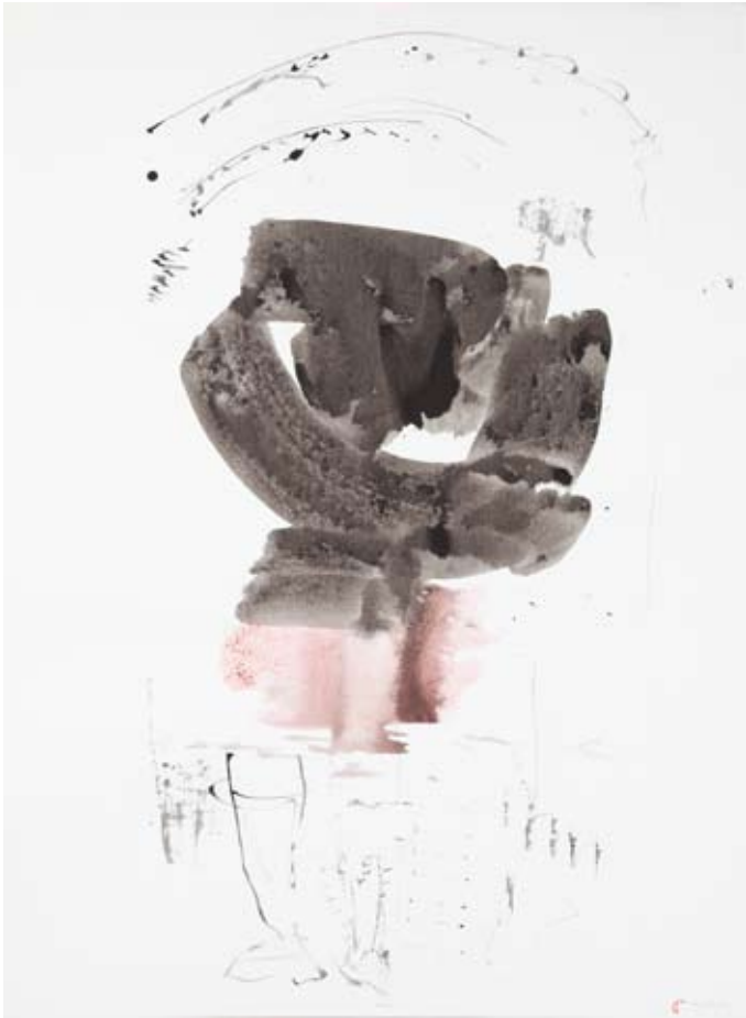
Untitled, Pink and Black, c.1975 Ink brush drawing, 77.5 x 57 cm Signed with initials